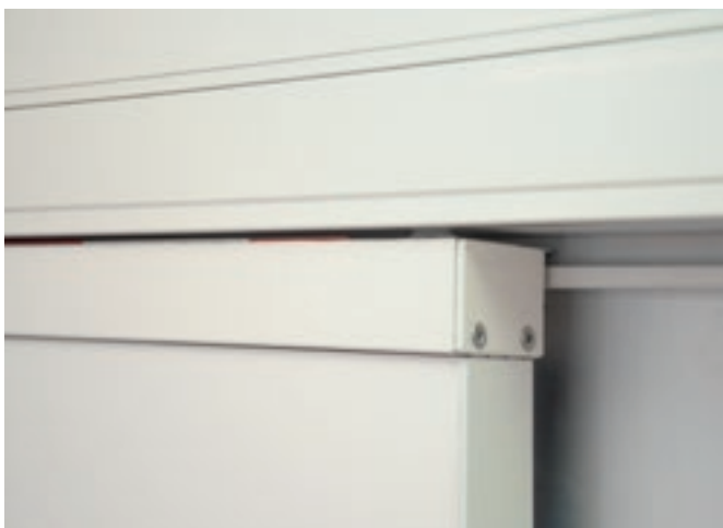
Top door leaf connected to operator