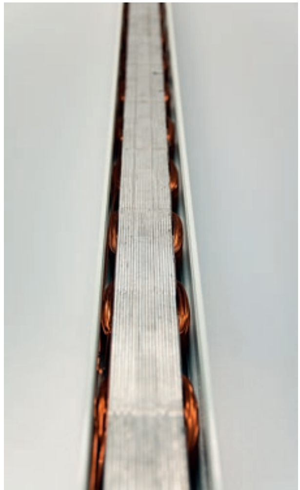
Linear motor inside operator