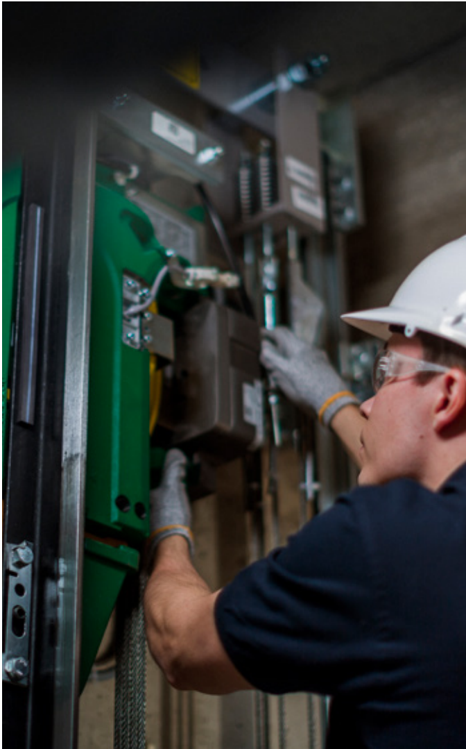
Elevator modernization is an investment that pays off in a number of ways. It reduces repair and energy costs, with potential savings amounting to thousands of euros. And a modern, spacious elevator adds to the value of your building.