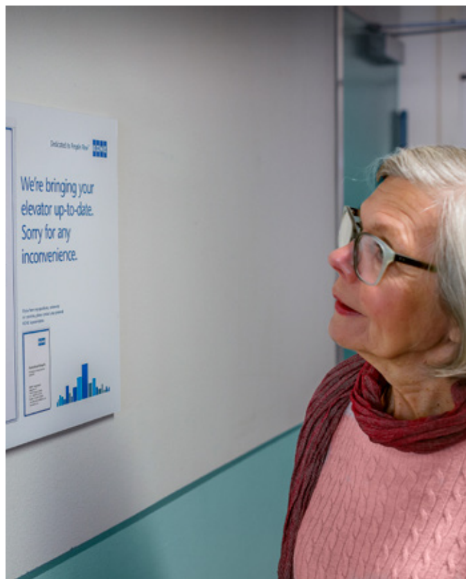
Residents can stay up to date with schedules and progress via the KONE InfoMod board.