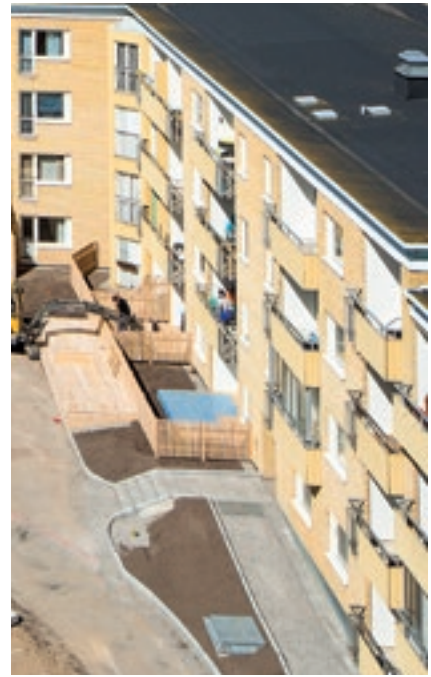
The residential building in Eskilstuna.