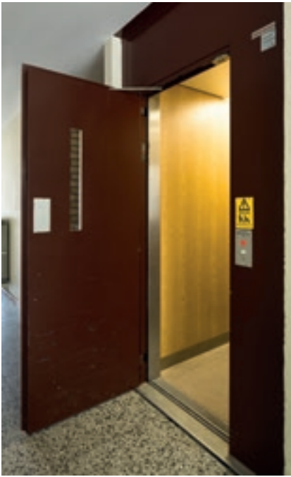
Old elevator before modernization.