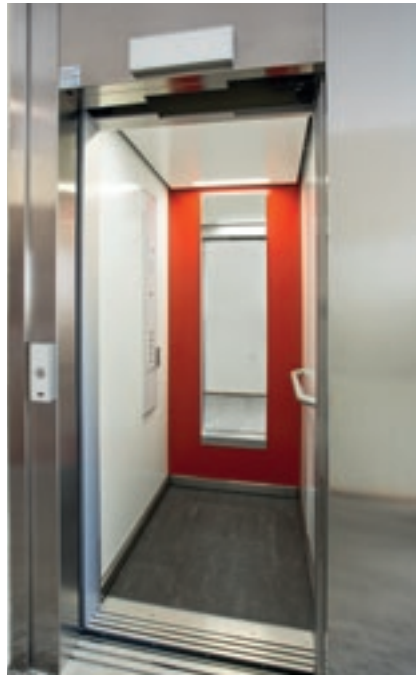
KONE MonoSpace® after modernization.